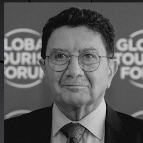
Dr. Taleb Rifai