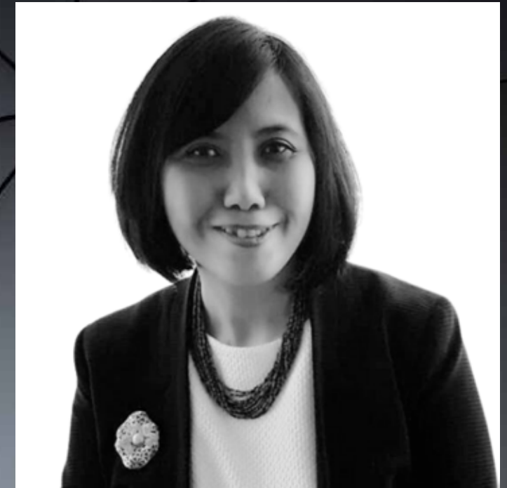
DR. DEVI ROZA KAUSAR

Minister of Agriculture of the Republic of Indonesia (tbc)