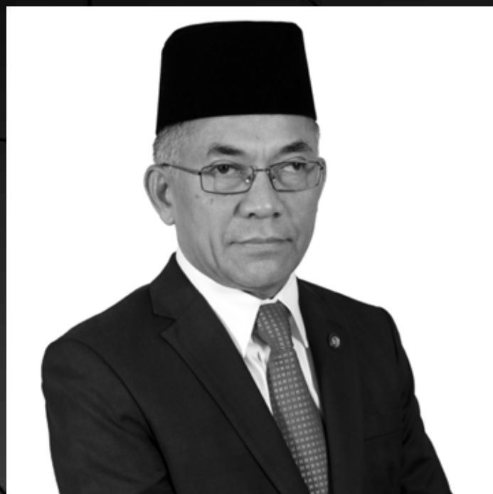
AWANG HAJI ALI BIN APONG

Minister of Primary Resources and Tourism of Brunei Darussalam (tbc)