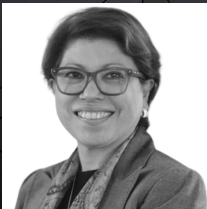
DR. REBECCA FATIMA STA MARIA

Minister of Tourism and Creative Economy of the Republic of Indonesia