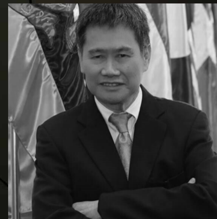
H.E. LIM JOCK HOI

Minister of Tourism and Sports of the Kingdom of Thailand