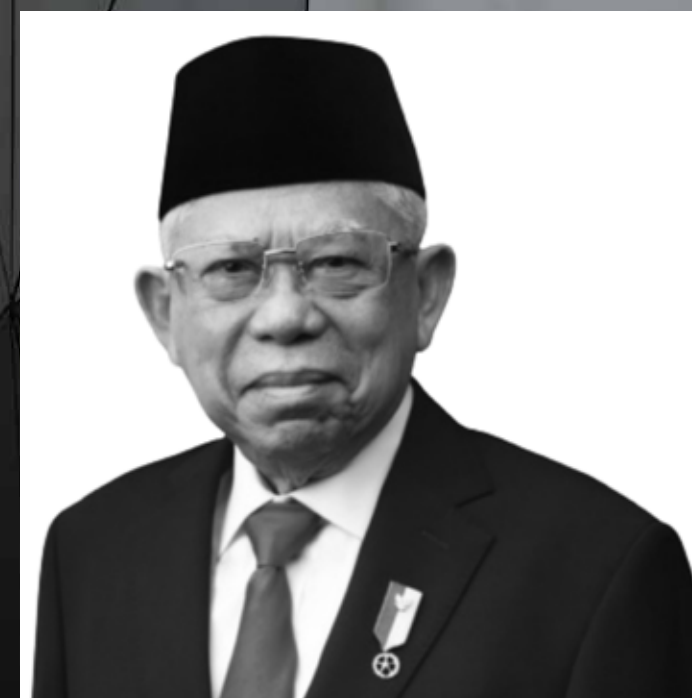
H.E. PROF. MA`RUF AMIN

the Vice President of the Republic of Indonesia