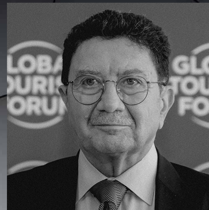
DR. TALEB RIFAI

Director of Ecotourism sector, UNESCO chair "Con-E-Ect"