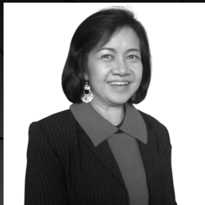
LILY GRETA KARMEI

Vice Minister of Foreign Affairs of the Republic of Indonesia