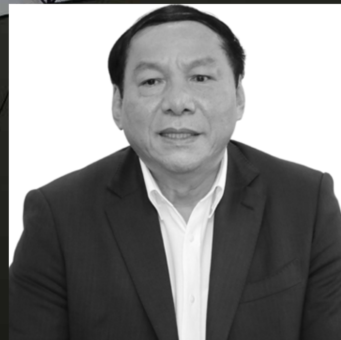
H.E. NGUYEN VĂN HÙNG

Minister of Culture, Sports, and Tourism of Socialist Republic of Vietnam