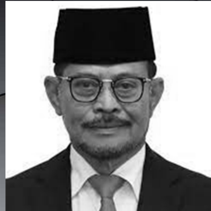
DR. H. SYAHRUL YASIN LIMPO

Conference Advisory-Chairman of Halal Expo Canada – New Business Model and Technology (Case of Canadian Halal Industry)